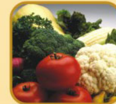
FRUIT & VEGETABLES