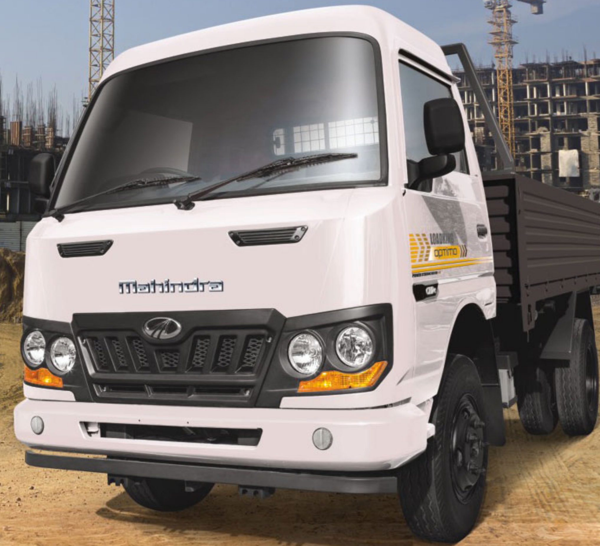
Load King OPTIMO BSIV - Heavy Duty Cargo & Tipper

NO COMPROMISE ON PROFITABILITY. NO SHORT CHANGING ON STYLE.