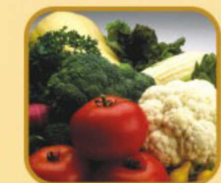
FRUIT & VEGETABLES