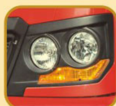
Clear lenses headlamps