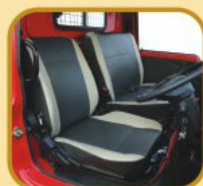
Dual tone seats