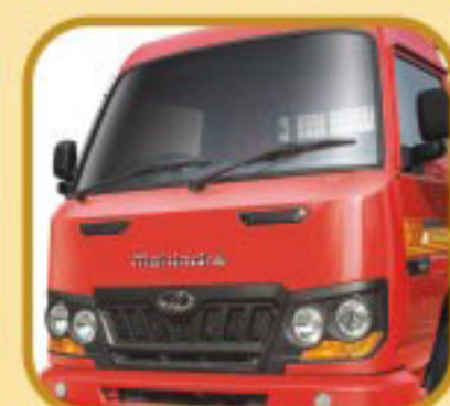
Front fascia grill, bumper, vent