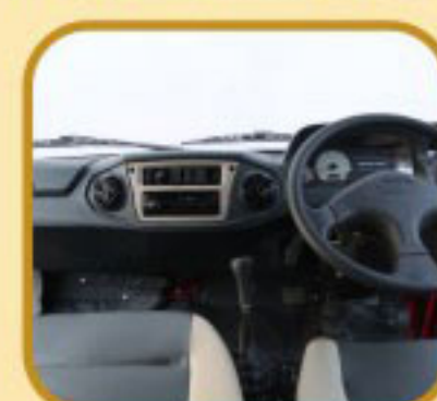
Injection molded IP