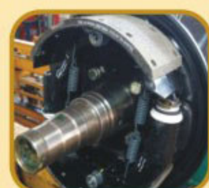
Bigger brakes 320 x 110 (mm)