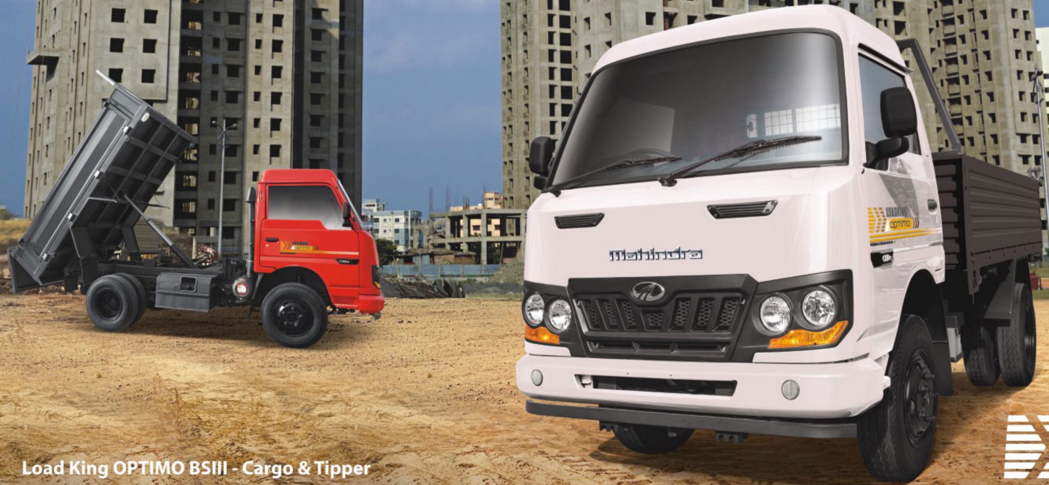
Load King OPTIMO BSIII - Cargo & Tipper

NO COMPROMISE ON PROFITABILITY. NO SHORT CHANGING ON STYLE.